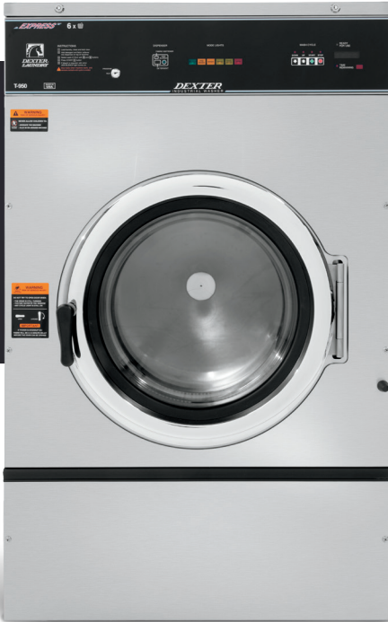
6 Cycle Control