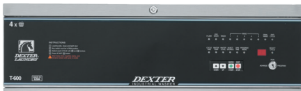
30 Cycle Control