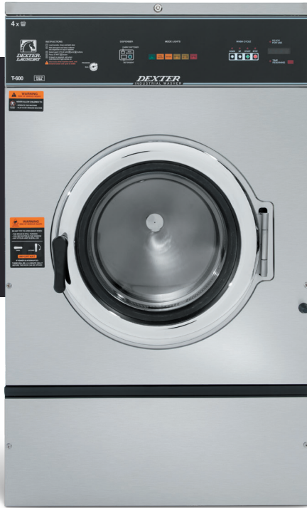
6 Cycle Control